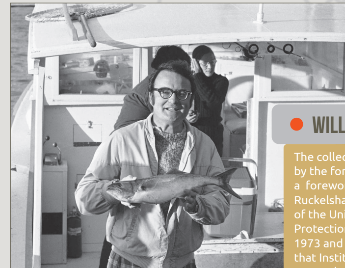
HENRY GRIFFIN / ASSOCIATED PRESS 1973