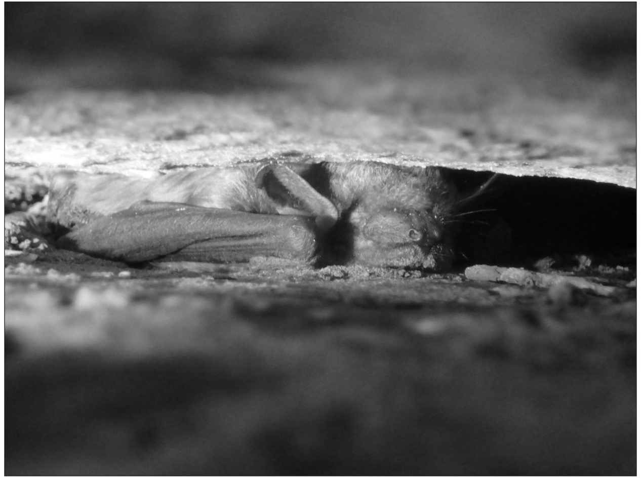
Figure 3. Eptesicus fuscus observed roosting in a gypsum cave system in Scurry County, Texas, on 5 February 2017.

Bowie County.—On 27 January 2017, a South-eastern Myotis of unknown sex was observed roosting in a culvert along I-30 near Hook, Texas (33.46593°N, 94.23925°W). This individual was located approximately 30 m from the entrance of the culvert at a height of 2.3 m and was alert and responsive. Due to the roosting height of the bat, this individual was not swabbed nor tested for signs of P. destructans and was not collected as a voucher. Although not a county record for the species (Schmidly and Bradley 2016), this documentation of M. austroriparius represents the first winter observation of the Southeastern Myotis for Bowie County.