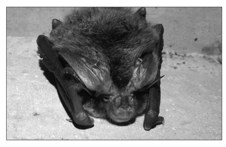
Figure 2. Corynorhinus rafinesquii observed roosting in a box culvert in Marion County, Texas, on 26 January 2017.